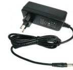
DC12V/3A Power Supply