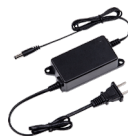
PFM320 12V 2A Power Adapter